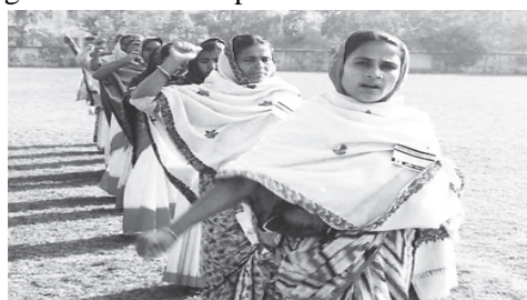
Women are more confident and aware of their rights

The purpose of microcredit loans is to make poor people aware of their latent potential and make them ready to actively participate in improving the overall development of the underprivileged people's life at the grassroots level. The Grameen Bank proved in Bangladesh and other parts of the world that if there is even a little opportunity, then the latent power of the poor and women can be explored and their capacity building increased to reach the goal of social development of their own and subsequently improving their socioeconomic, cultural and political condition in the society. Empowering women in developing countries depends upon the ownership and control of asset, participation in socioeconomic, cultural and political activities are involved in decision making, mobility, education, awareness building and skill development of the women in a society. Even participation and contribution to the family and society